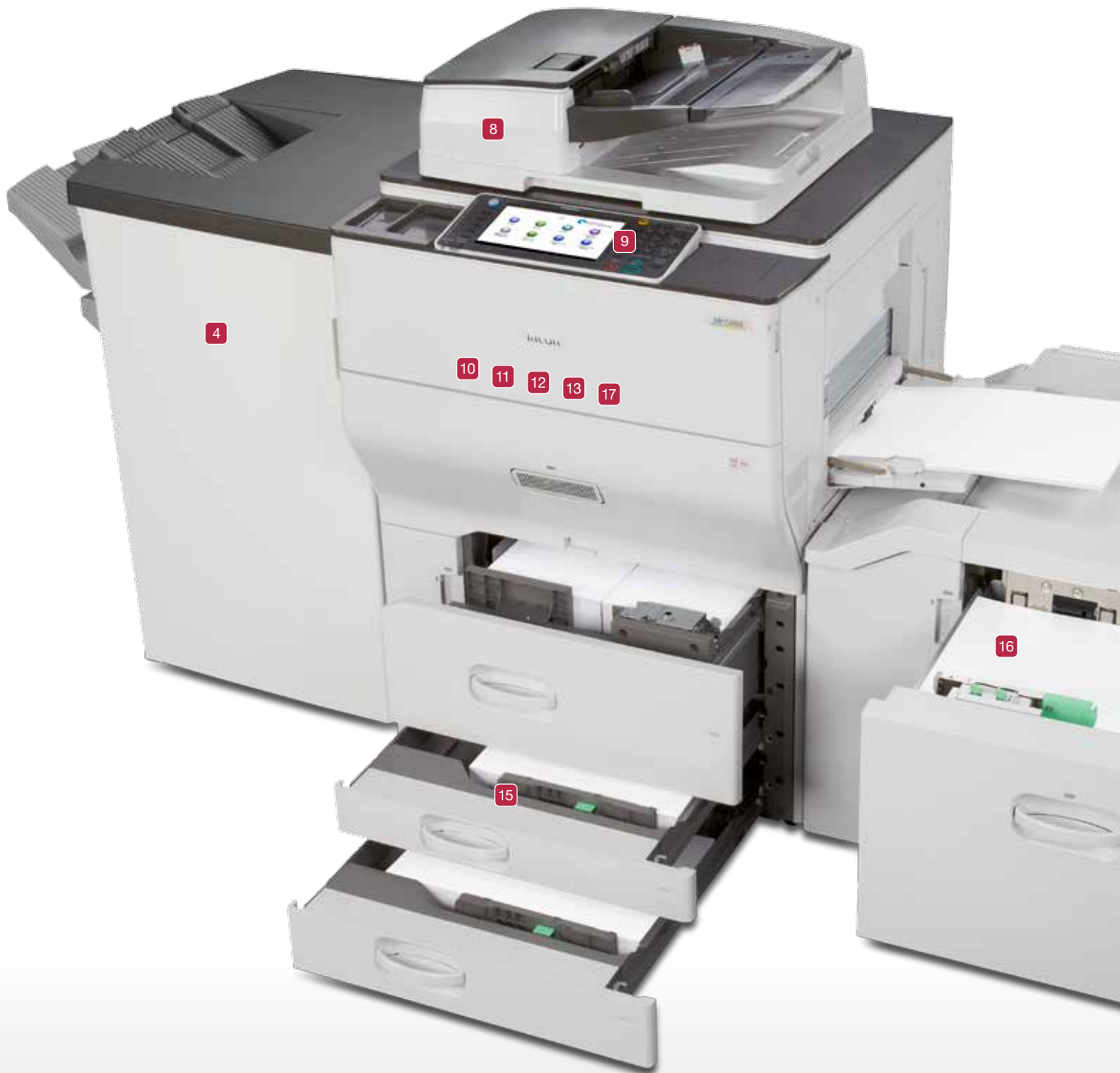
Ricoh MP C6502/MP C8002